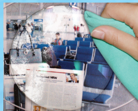
Easy clean on Supreme COAT™