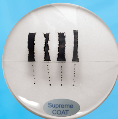
Better wetting properties