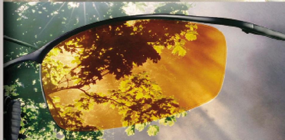
OUTDOORS: BRIGHT LIGHT